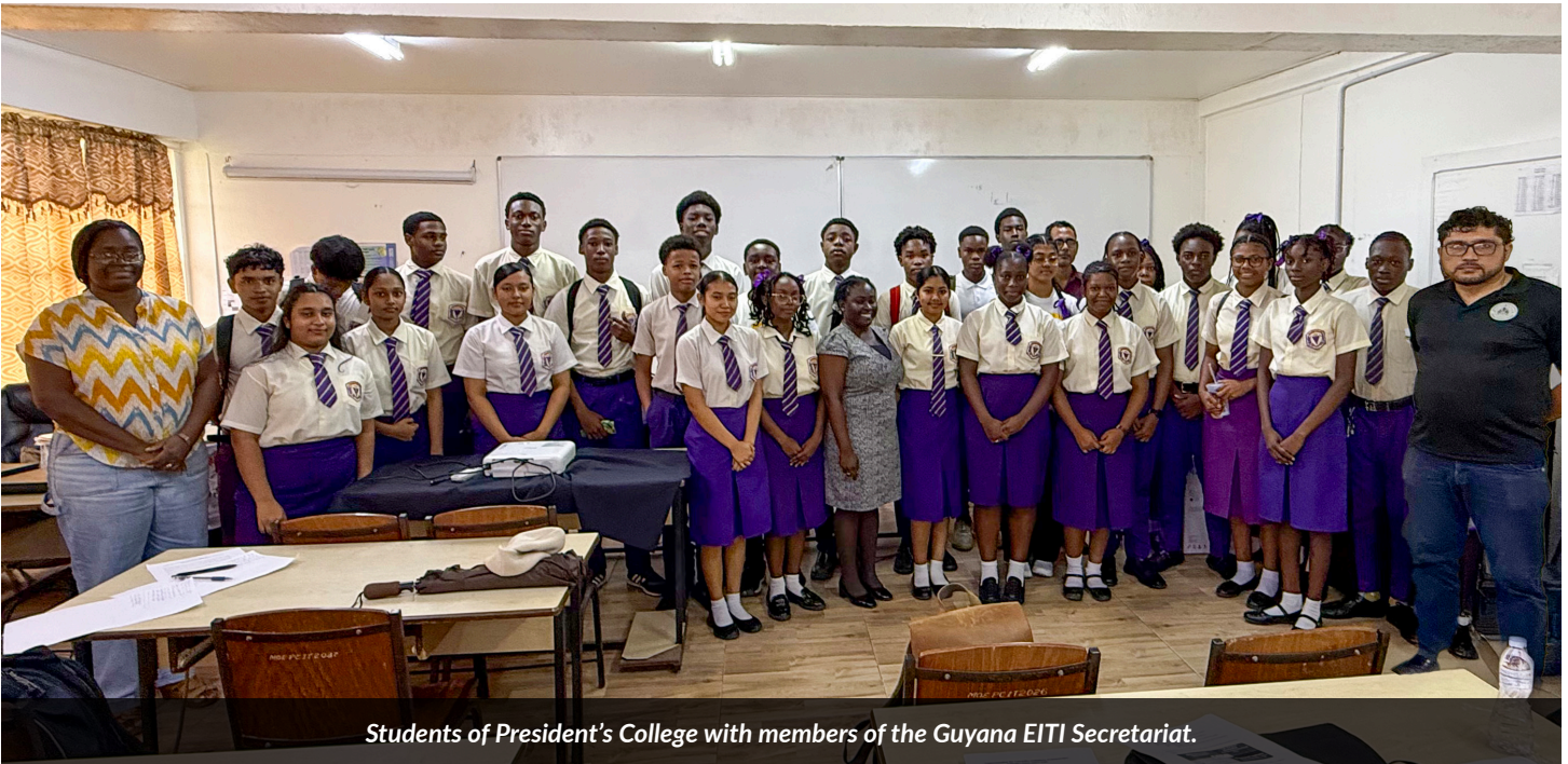
Students of President's College with members of the Guyana EITI Secretariat.

As part of the communications and outreach efforts outlined in its work plan, the Guyana EITI Secretariat held a series of student engagement sessions across several secondary schools in Georgetown.