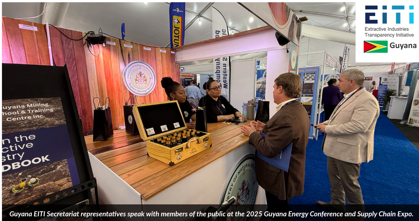
Guyana EITI Secretariat representatives speak with members of the public at the 2025 Guyana Energy Conference and Supply Chain Expo.