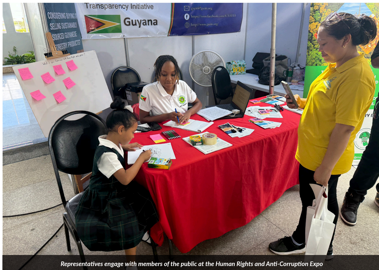
Representatives engage with members of the public at the Human Rights and Anti-Corruption Expo